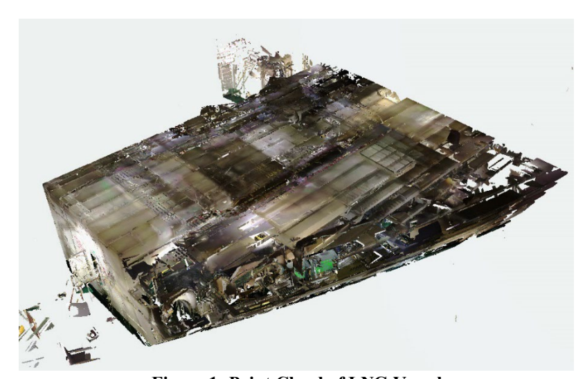
Figure 1: Point Cloud of LNG Vessel