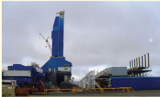
Liberty rigs being readied to work for BP.