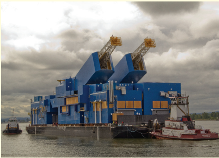
AADU (Alaskan Arctic Drilling Units) 1,800 HP Rigs enroute to Prudhoe Bay, Alaska by Parker Drilling.