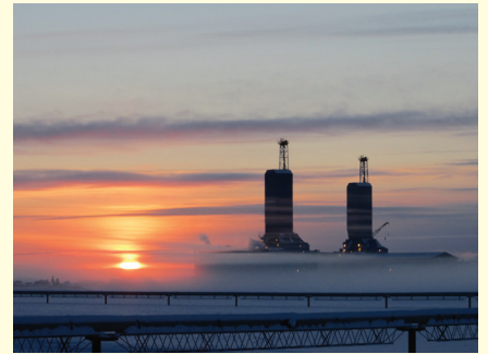
AADU rigs on location in Prudhoe Bay, Alaska.